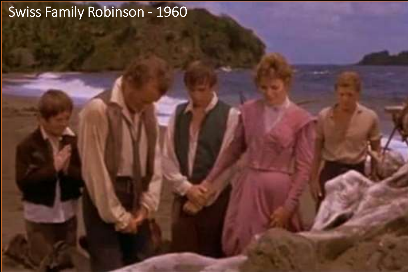
Swiss Family Robinson - 1960