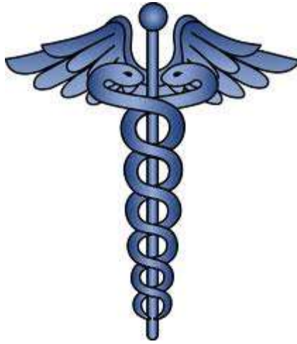
Cadauceus: Symbol of commerce, often confused as the medical symbol