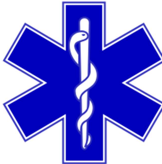
Modern symbol For medicine